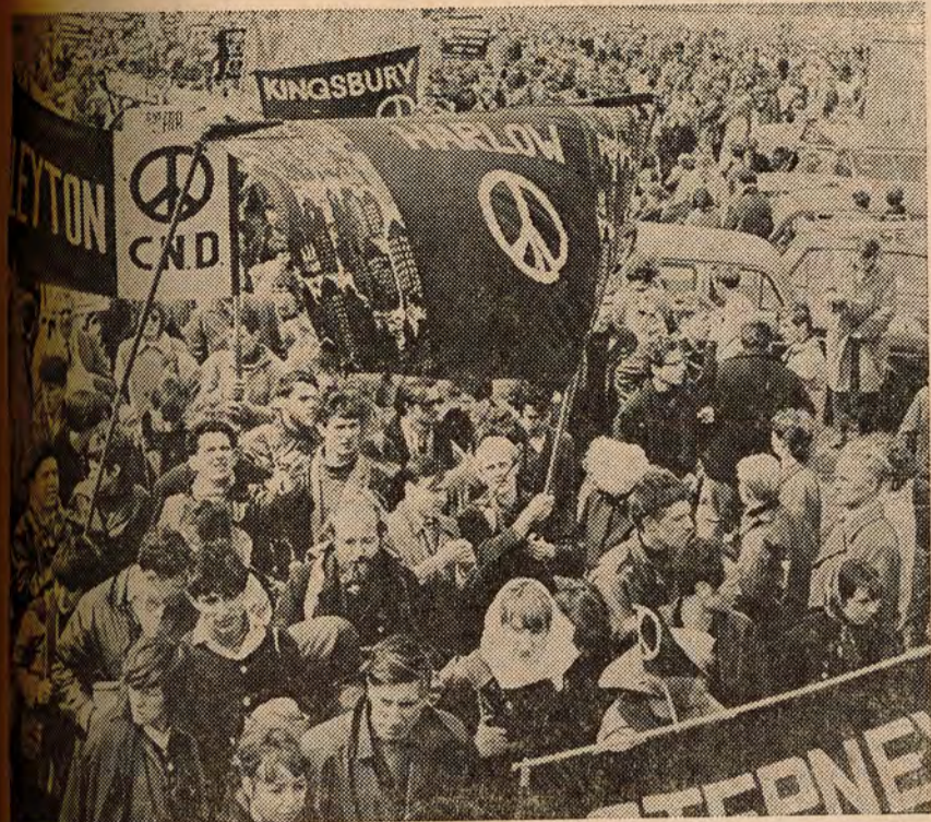
Good Friday: March assembled at Aldermaston. An estimated 11,000 walked to Reading. "Spies for Peace" pamphlet published.