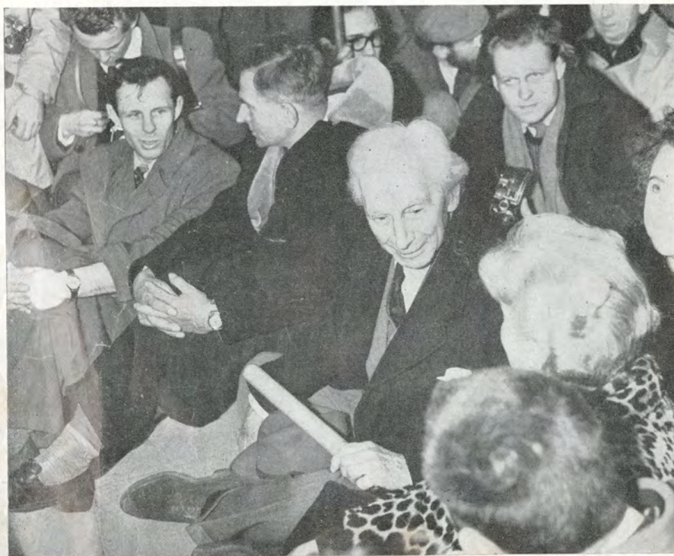
Earl Russell and Rev. Michael Scott in the non-violent demonstration outside the Ministry of Defence, 18th February, 1961.